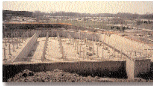
Figure 1: The Hap Cremeans water treatment plant in Columbus, OH used 30% slag cement with Type II portland cement to achieve sulfate resistance.

Waterborne sulfates react with hydration products of the tri-calcium aluminate