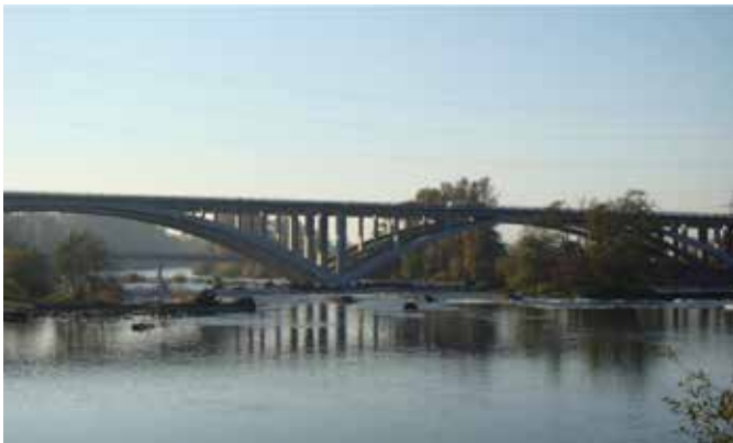
Willamette River Bridge, Eugene, OR

The Willamette River Bridge provides a critical link on the I-5 corridor near Eugene, OR. In 2002, shear cracks found in the original 1961 structure prompted installation of a temporary bridge and plans for permanent northbound and southbound bridges. Construction of the new bridges began in the summer of 2009. By mid-2013, both the 1985 ft (605 m) long northbound and the 1759 ft (536 m) long southbound bridges were completed.