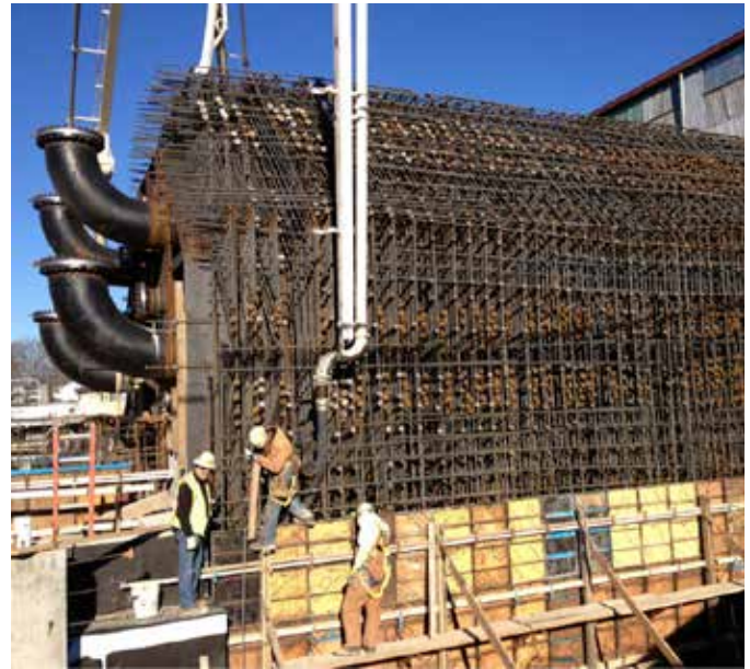
Mechanical Dynamics and Analysis High-Speed Balance Facility "Spin Cell," St. Louis, MO

to a drive shaft powered by external motors and tested to well beyond rated capacity. The chamber interior is evacuated of most air, oil is sprayed as lubrication and coolant, and the electricity generated by the unit being tested is dissipated through an extensive grounding system. The minimum 5 ft (1.5 m) thick and heavily reinforced and armored concrete chamber is designed to contain shrapnel from any generator explosion/disintegration. The mass concrete construction used a high slag cement content self-consolidating mixture.