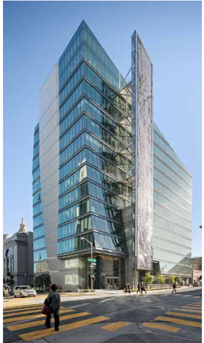
San Francisco Public Utilities Commission Headquarters, San Francisco, CA