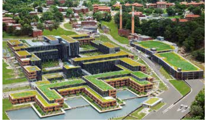
U.S. Coast Guard Headquarters, Washington, DC

The SCA represents companies that produce and ship over 90% of the slag cement (ground-granulated blast-furnace slag) in the United States. Through a program of continuous research, promotion, and education, SCA communicates the performance and sustainable benefits of this cementitious material to stakeholders throughout the construction industry. More information is available at www.slagcement.org .