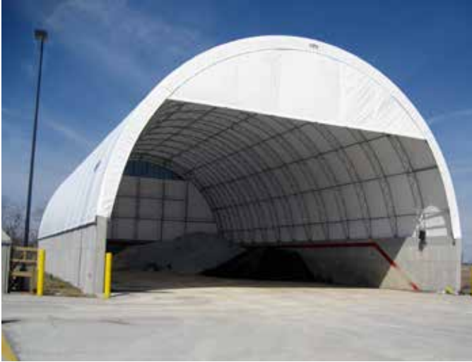
Ohio Department of Transportation Jefferson County Maintenance Facility, Wintersville, OH

portland cement, and microsilica were used to increase strength and durability.