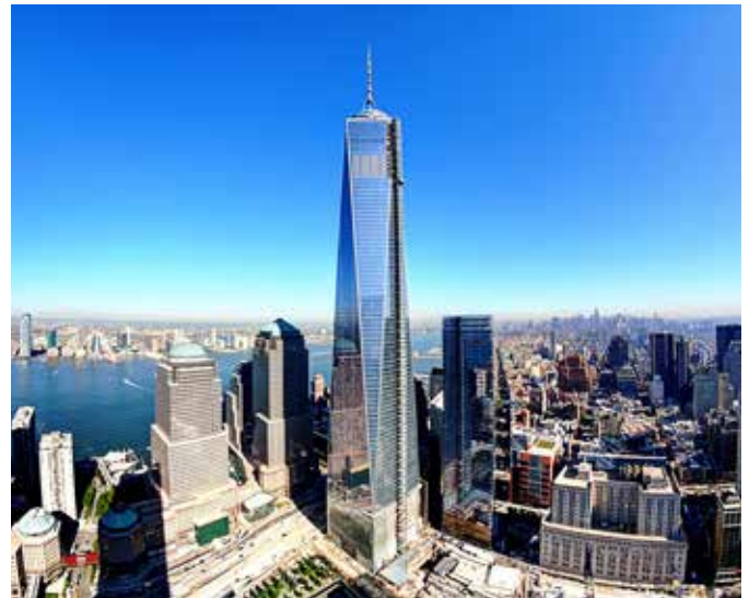
One World Trade Center, New York, NY

Much research was undertaken and several concrete mixtures containing slag cement were developed to meet performance criteria for various One World Trade Center foundation and structural elements and for the World Trade Center Memorial and Museum mass concrete placements. Concrete mixtures included a quaternary mixture used in lower elevations that contained 52% slag cement with portland cement, fly ash, and silica fume. This combination