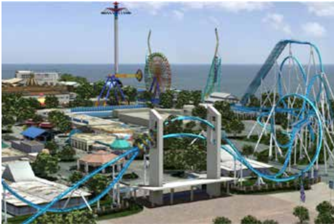
Cedar Point Amusement Park GateKeeper Roller Coaster, Sandusky, OH

Project credits: Cedar Fair Entertainment Company, Owner; Tony Ravagani Architects, Architect; Bowser-Morner, Inc., Engineer; AA Boos & Sons Inc., Contractor; Elite Concrete Industries, Concrete Supplier; and St Marys Cement, Inc., Slag Cement Supplier.