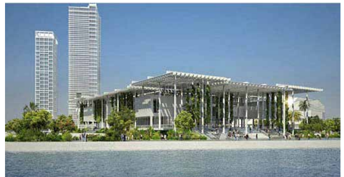
Pérez Art Museum Miami, Miami, FL

facilities. The owner selected a 6 in. (150 mm) concrete pavement alternative to asphalt for the project, and a total of over 4000 yd 3 (3060 m 3 ) of concrete was placed in pavements, floors, and walls during July and August of 2013. Ternary concrete mixtures containing slag cement,