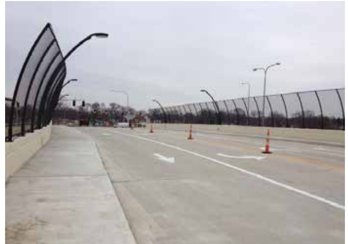
Ohio Department of Transportation Project 10-0281 ProMedica Bridge Deck, Toledo, OH

A ternary mixture was used with portland cement replacement levels of 25% slag cement and 25% fly ash. Specifications called for 4500 psi (31 MPa) at 28 days, 6% ± 2% air entrainment, a 4 to 8 in. (100 to 200 mm) slump, and maximum permeability rating of less than 1500 coulombs. Results of 390 performance tests run on 12,650 yd 3 (9670 m 3 ) showed an average of 7910 psi (45 MPa) compressive strength, 6% air entrainment, and 6-3/8 in. (160 mm) slump. The mixture tested at 752 coulombs under ASTM C1202, "Standard Test Method for Electrical Indication of Concrete's Ability to Resist Chloride Ion Penetration." An average of 5650 psi (39 MPa) was reached after more than two hundred 7-day strength tests were completed. The use of slag cement in this concrete mixture provided a very consistent, workable mixture that exceeded strength and durability criteria,