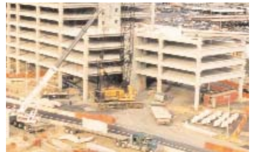
Precast/prestressed elements at the Philadelphia Airport parking garage incorporating slag cement.