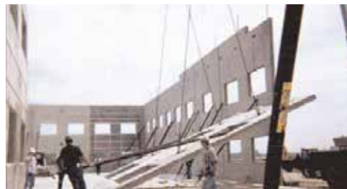
Precast tilt-up elements incorporating slag cement are made on the jobsite.

Slag cement is lighter in color than portland cement. Elements made with slag cement will therefore have a lighter finished color. The higher the percentage of slag cement used, the lighter the color will be. This provides greater visibility of the elements and potentially improved safety.