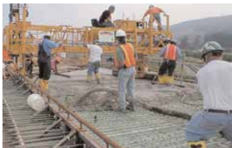
Figure 2: Route 64 bridge deck in Smithburg, MD used high performance concrete with 40 percent slag cement as part of a corrosion-resistant system that extended the predicted life of the structure by 37 years. (Contractor-Joseph Faye Co.; Concrete Supplier-Thomas Bennett Hunter)

In a real-world example, the Maryland State Highway Administration constructed a bridge deck for Route 64 in Smithburg, MD (Figure 2) and compared