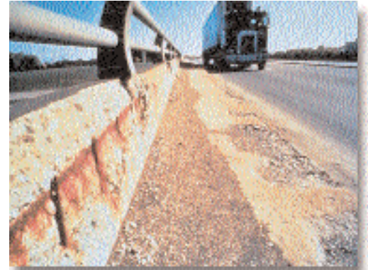
Figure 1: Permeable concrete is a principal reason for concrete deterioration due to reinforcing steel corrosion and other deterioration mechanisms.

A common way to measure permeability of concrete is standard test method ASTM C1202 "Electrical Indication of Concrete's Ability to Resist Chloride Ion Penetration," also known as the rapid chloride permeability test. This method is the most accepted test to determine the relative permeability of concrete. A 60 V electrical potential is established across a sawed four inch diameter concrete cylinder section. The total current passing through the section over time and