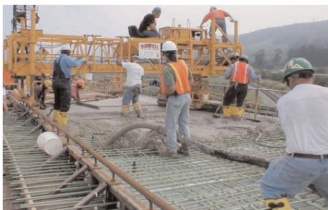
Figure 2: Route 64 bridge deck in Smithburg, MD used high performance concrete with 40 percent slag cement as part of a corrosion-resistant system that extended the predicted life of the structure by 37 years. (Contractor-Joseph Faye Co.; Concrete Supplier-Thomas Bennett Hunter)

In a real-world example, the Maryland State Highway Administration constructed a bridge deck for Route 64 in Smithburg, MD (Figure 2) and compared